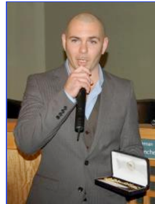
Latin rapper Pitbull speaks after being presented with a key to the city Wednesday, Aug. 19, 2009 at Miami City Hall in Miami. His single, "I Know You Want Me (Calle Ocho)," topped charts worldwide and reached No. 2 on the American Billboard Hot 100. Aug. 19, 2009.